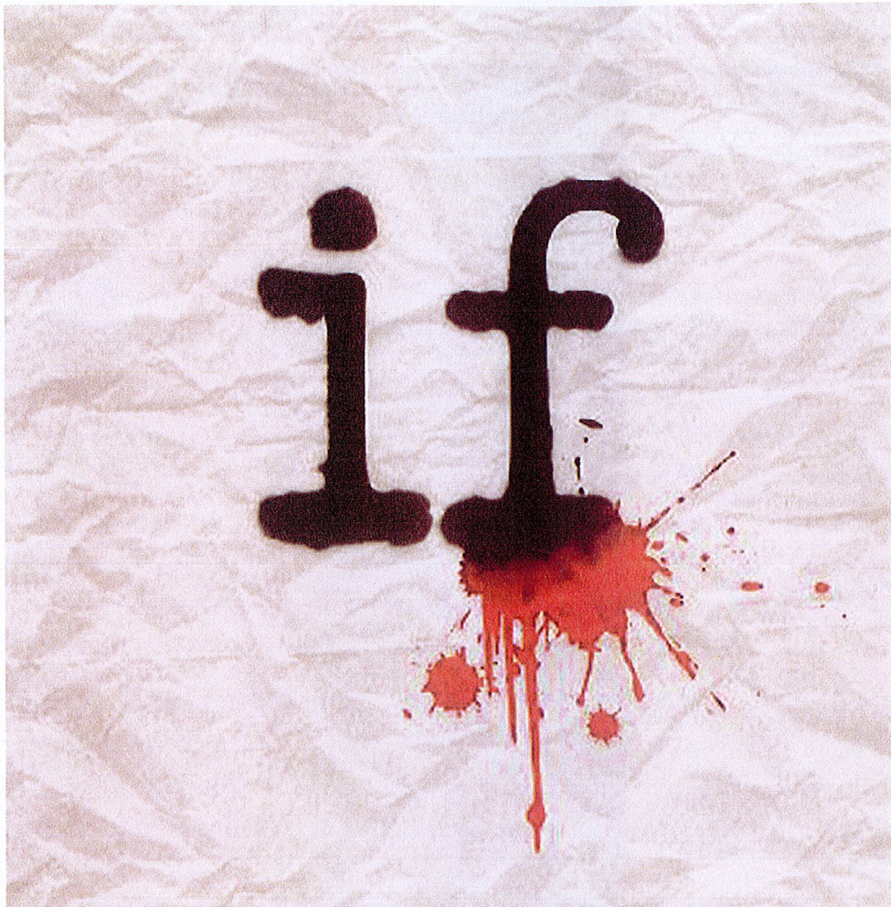
Kelda: CD cover for the 2008 album by the group Mindless Self Indulgence