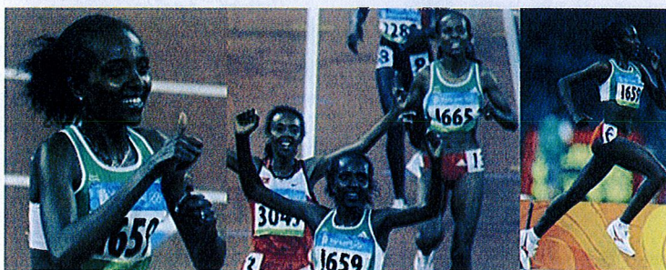
T. Dibaba became the first woman to win the 5 km & 10 km races at the same Olympics. (2008)

www.uefa.com/uefaeuro/season=2008/photos/index.html